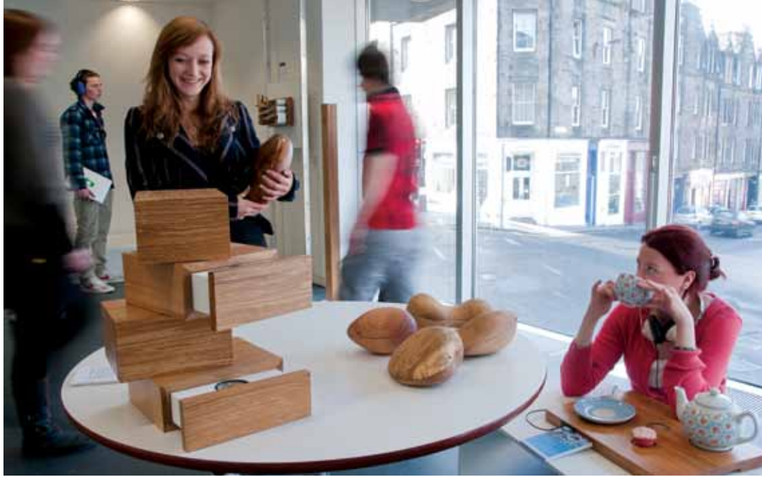
MA/MFA Product Design

Product Design at the College explores new ways of making connections between objects and people in an ever-changing world. Focusing on the design and manufacture of products, the philosophy of the course is firmly rooted in traditional making and manufacturing techniques but also encourages students to take a lateral view, to develop products that are not only appealing but also innovative in their thinking and lasting impact – designing our collective future.