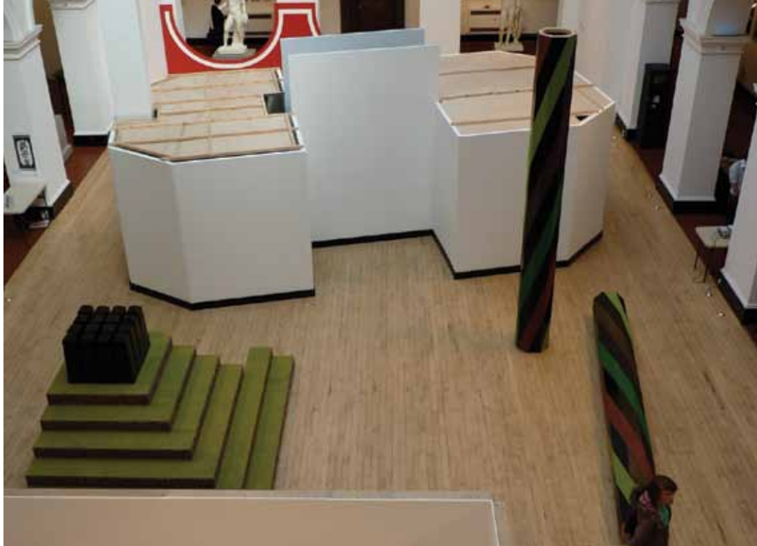
MA/MFA Contemporary Art: Practice

Image: MFA student work, Degree Show 2011