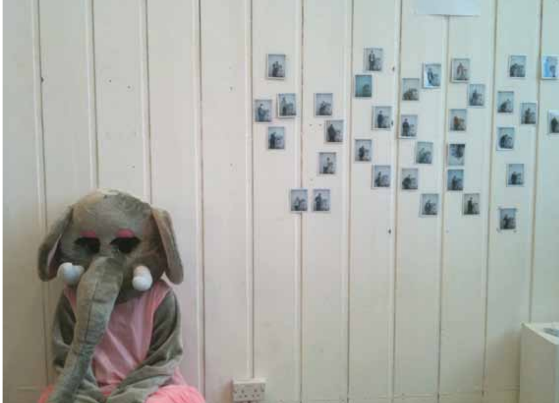
MA/MFA Contemporary Art: Photography

Image: Kimberly Abbott, MFA Photography Same Old Stuff , Project Space C02, 2011